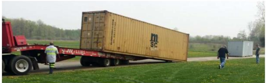
Our new storage shed 2015