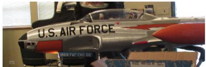
April show stopper 2017