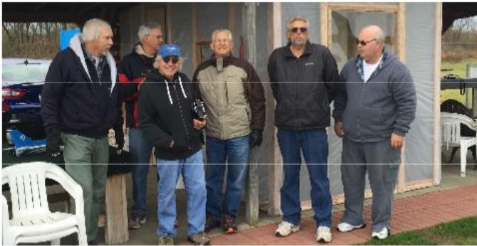
Cold weather crew Oct. 2015