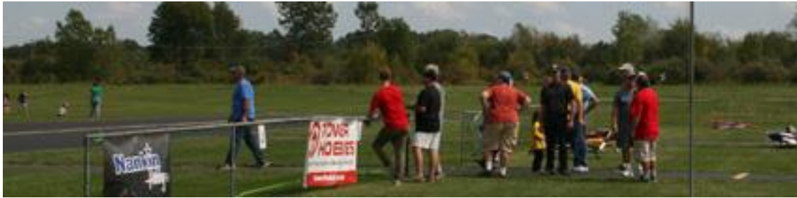
The People & Pilots